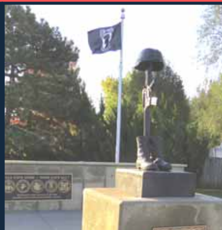
The Veterans Memorial was completed in October and is looking great!